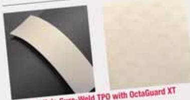
Carlisle Sure-Weld TPO with OctaGuard XT

*Carlisle's Sure-Weld TPO was tested as Product B. *Samples subjected to 275°F heat aging.